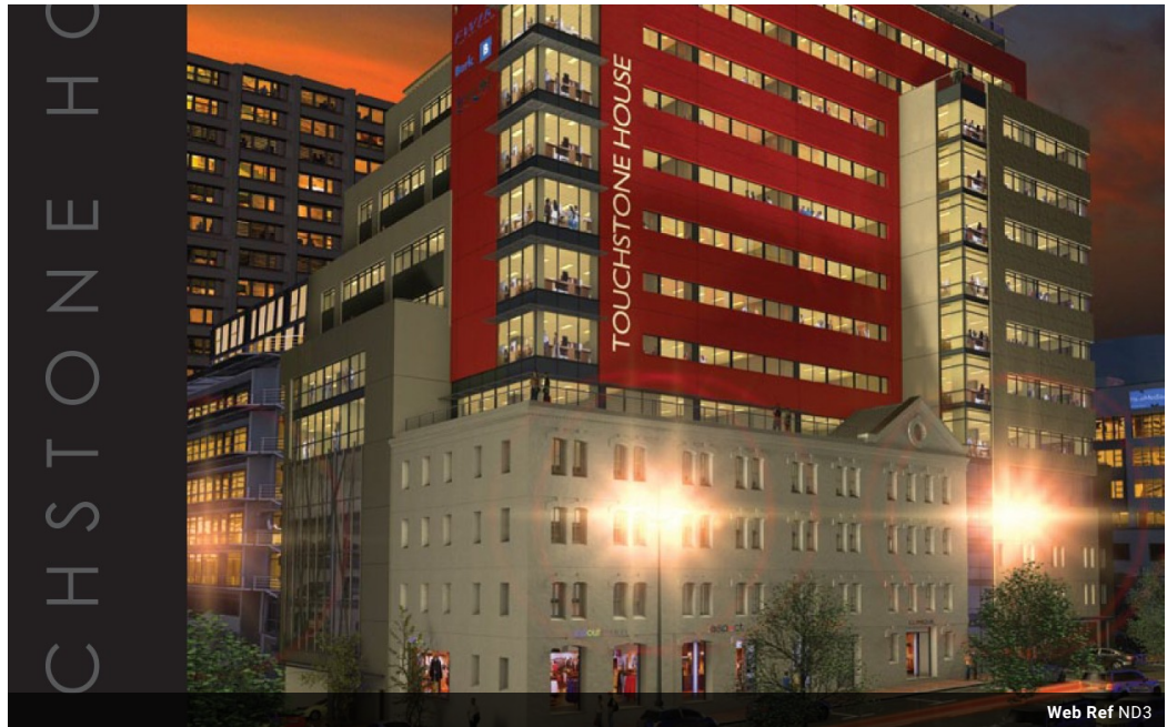
Web Ref ND3

Suite 1 3 Rydall Vale Crescent Umhlanga 4051