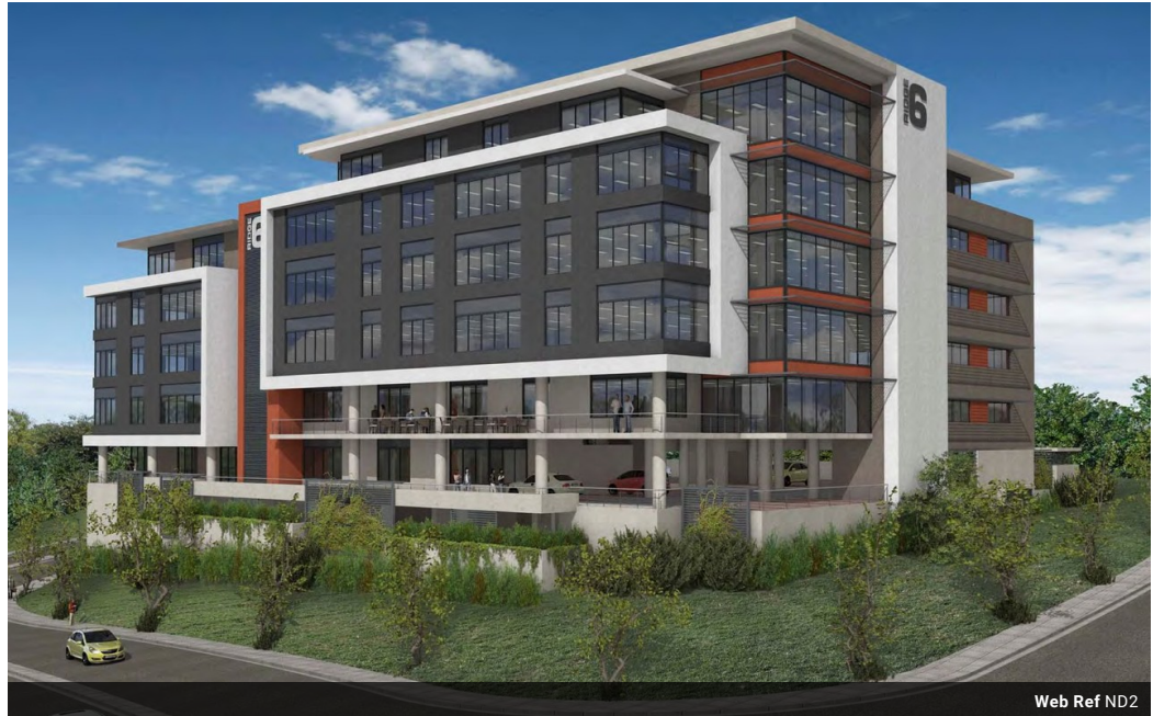
Web Ref ND2

Suite 1 3 Rydall Vale Crescent Umhlanga 4051